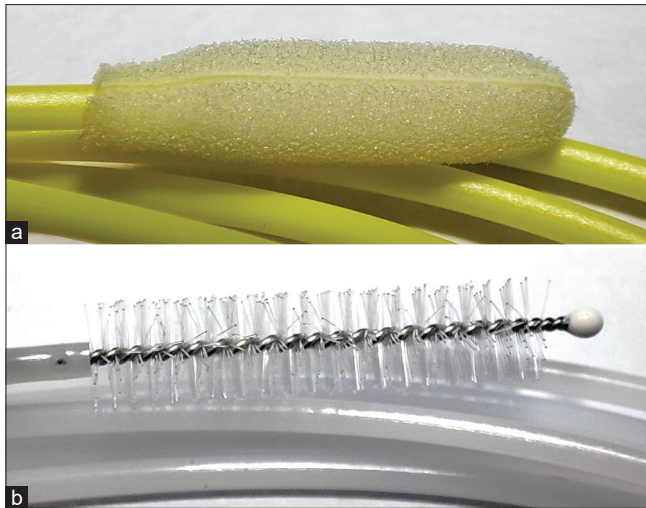
Figure 1: Photos of sampling brushes (a): PU brush (b): PA brush

Since 2016, we have used the observational research method for many years in Tianjin, the largest coastal city in northern China, comparing the microbial recovery effects of different sampling techniques (CFSM, FBFSM, and PASM). However, the small sample size collected each year and the significant differences in the endoscopes' background characteristics may lead to a particular selection bias and insufficient evidence for the sampling techniques' estimated effects. Although our previous research reported that FBFSM or PASM had been associated with the impact of endoscope microbial recovery, [1,27] it remains unclear if associations were attributable to selection bias.